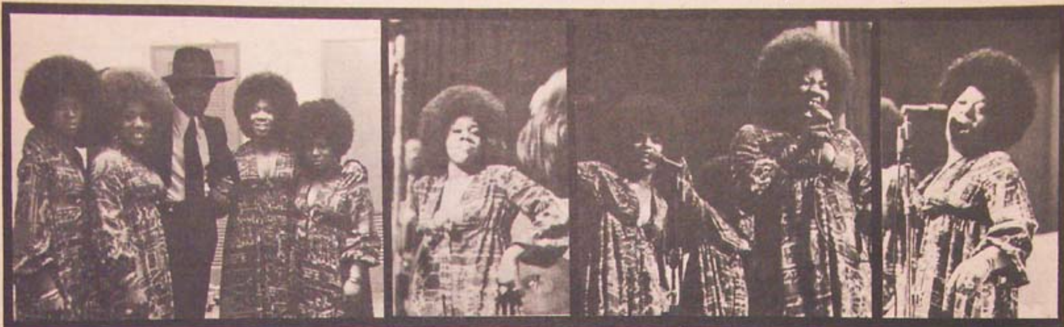
The SISTERS LOVE sang with love and clearly demonstrated their support of the people's survival programs.