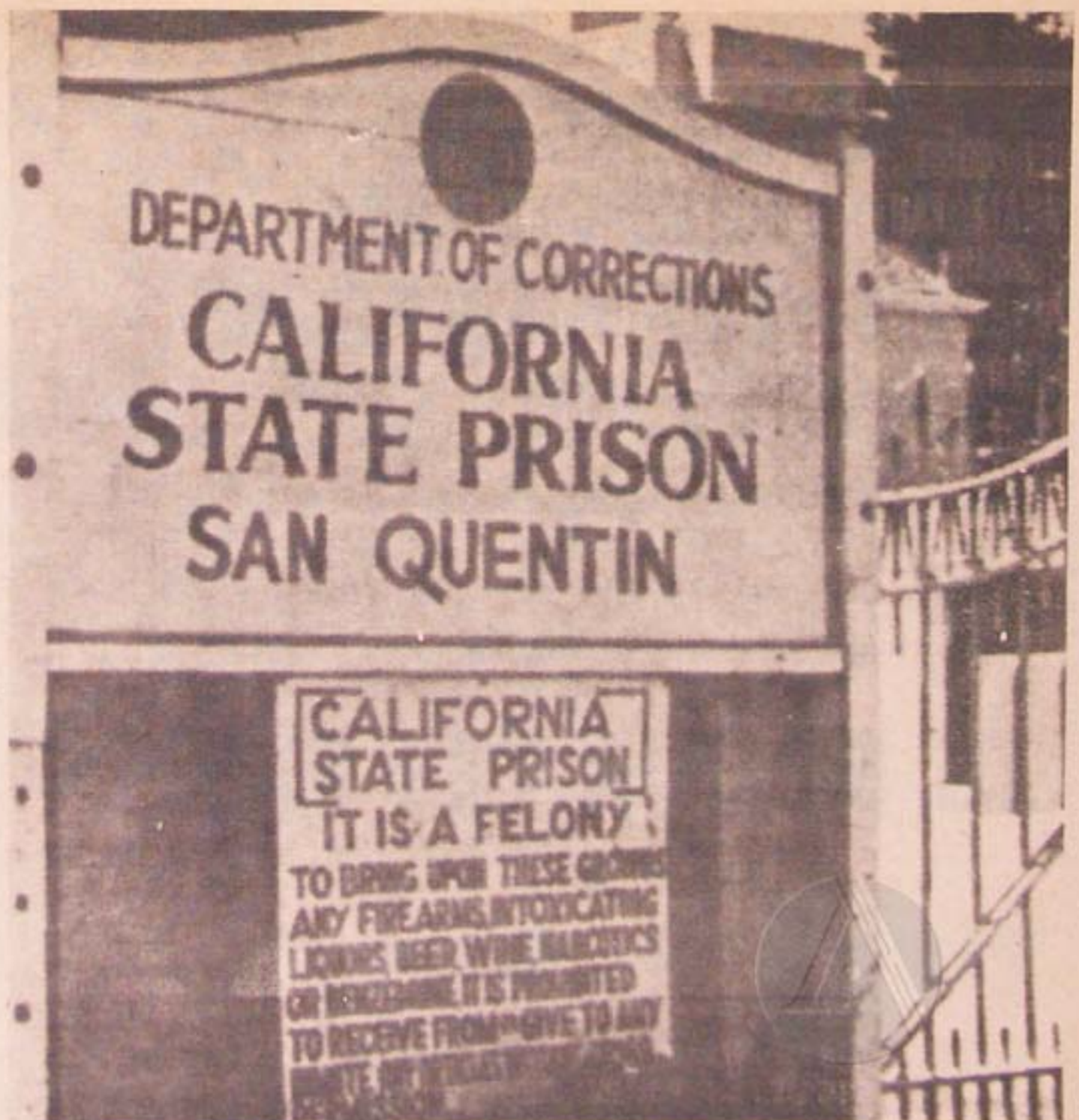
How much do they care about six more men's lives? How much do WE care?